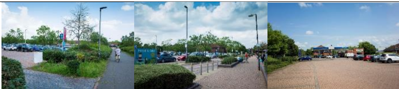
Werrington Centre Car Park

Tension over restrictions in use of community facilities e.g., gym, library, and proposals to fence off large areas of playing field for sole school use, limited space for Ken Stimpson expansion, lack of play areas although William Law playground (Locally Equipped Area for Play) is open outside of school hours