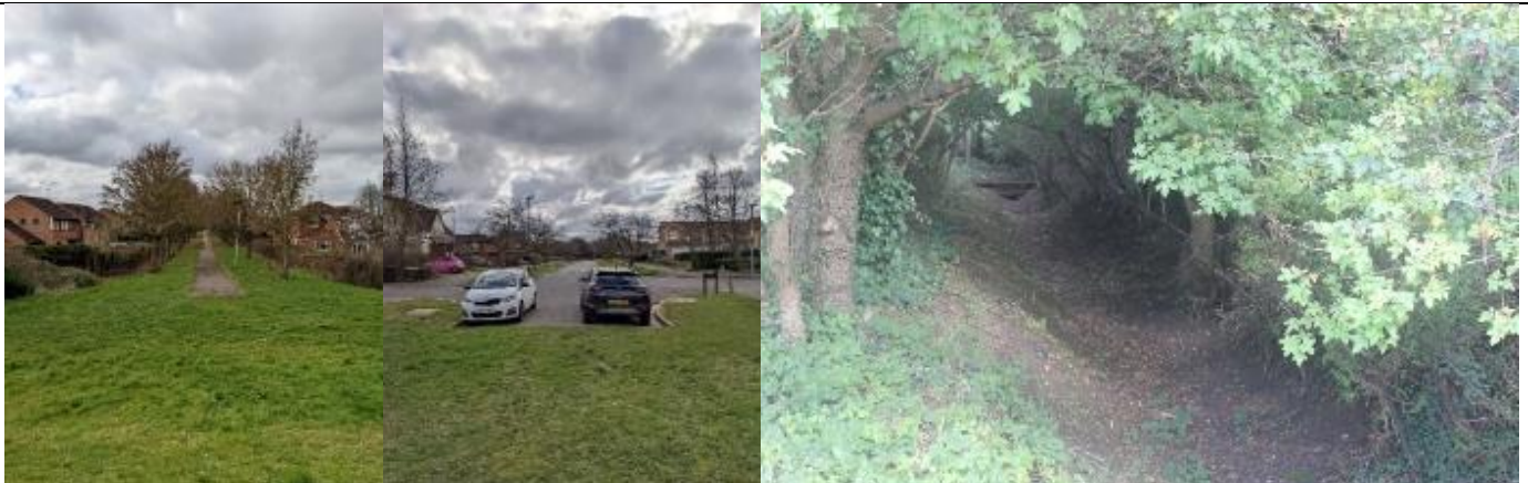
Dead end paths and roads adjacent to the Perimeter Footpath (Woodhall Rise and Sobrite Way), Wildlife Corridor at Papyrus Road