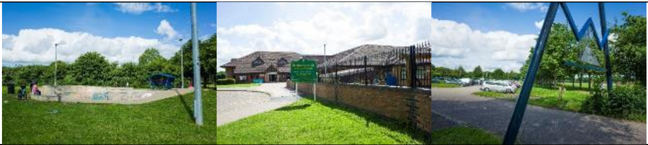
Skate Park, William Law Primary School and Community Car Park