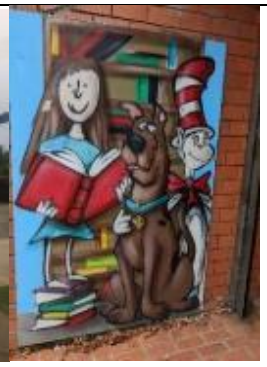
Street art at Blue Bell, Skate Park and the library