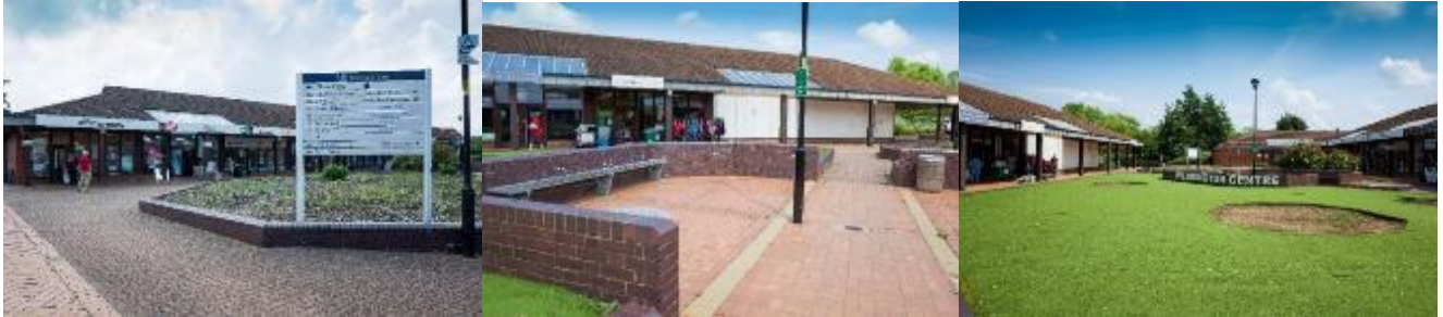
Werrington Centre, Central Square