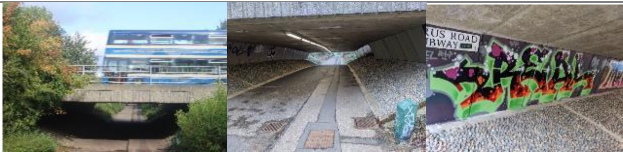
Papyrus Road Underpass going under Werrington Parkway with informal street art

Street Art: With Werrington being home to at least three street artists (one with international recognition) it follows that street art is a feature of Werrington. In addition to three underpasses, it can be found in many corners such as the library, Skate Park, Blue Bell and Frothblowers pubs, At Last Tea Room, Salt and Vinegar. Any graffiti found on communication boxes etc is removed by the community although it is disappointing when other agencies such as Network Rail does not allow the removal on their property such as Dukesmead Bridge.