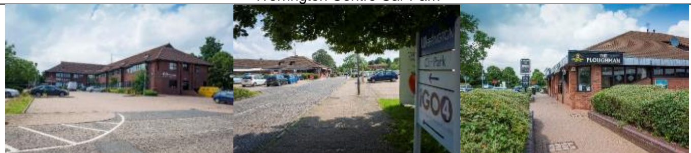
Offices and Ploughman Pub