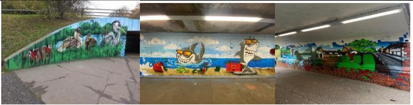
Street art in Cuckoos Hollow, Paston Parkway and Dauids Lane underpasses