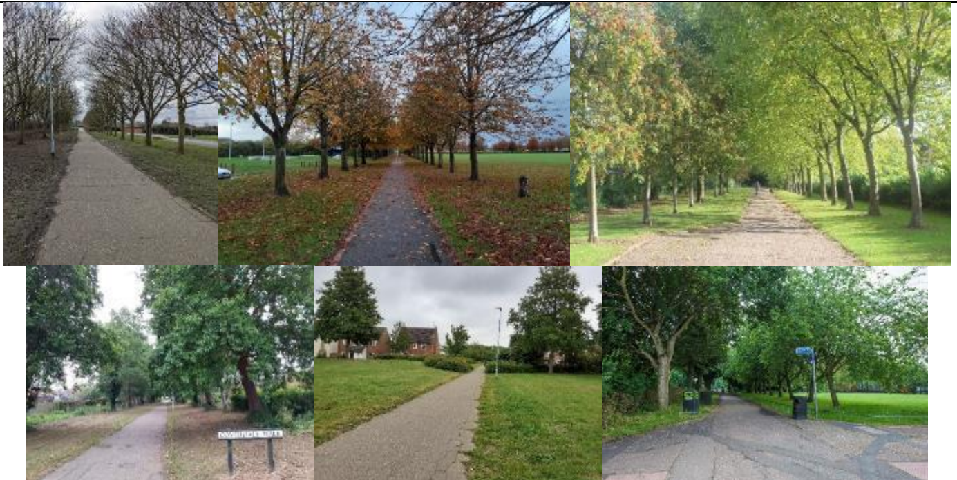
Views along the major Werrington Cycleways

COVERDALE WALK, SHELDRIK WALK, STIMPSON WALK, WILLIAM LAW PATH, CARDINALS GATE CYCLE PATHS: These cycleways and pedestrian routes encircling and linking the Ken Stimpson and Larks Green Playing Fields. They are well maintained and with the trees lining the route offer long attractive vistas.