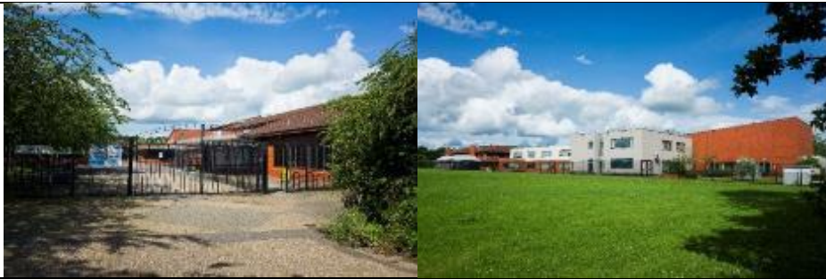
Ken Stimpson Community School