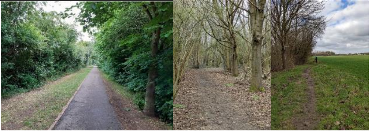
Sergeants Way and two views of the perimeter footpath

Wildlife Corridors: Werrington has varied wildlife living within its boundaries such as the wildfowl, frogs toads and occasional otters on Cuckoos Hollow, hedgehogs within gardens, foxes on the margins of the open spaces, great crested newts in the Newt Field (confirmed by a survey in 2022) and deer on the margins of the parkways. Whilst many of these are encouraged by the closeness to the countryside, they are not helped by the barriers of the railway fencing nor the wide busy roads on three sides. It is obvious that the cycleways and roads lined with wide margins of trees and vegetation are providing good secluded habitats for shelter but are providing safe corridors linking the different residential and countryside areas. Particular well-used paths are those alongside the Brook by Dukesmead, through the woodland adjacent to the parkways such as those by Carron Drive/Staverton Road and Papyrus Road. See Open Space Assessment for further details of these areas