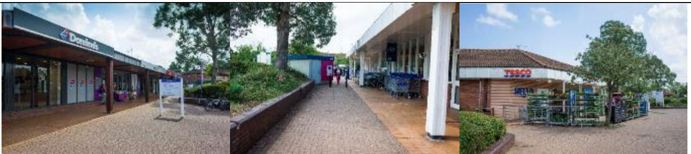
Werrington Centre Approaches